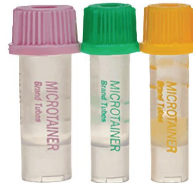
FBC CRP Chem 20 if possible