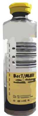
Blood Culture helps later