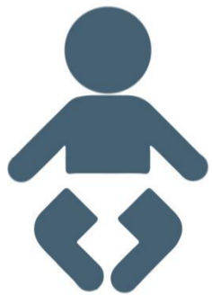
Age < 3 months