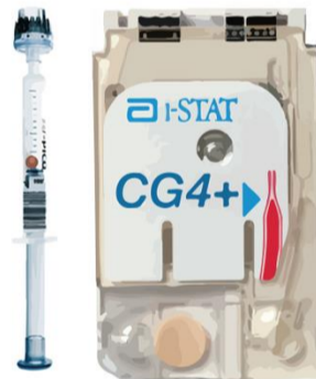
Venous Gas including Lactate