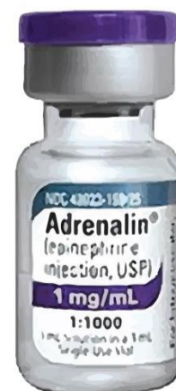
Consider Inotropes can be safely started peripherally