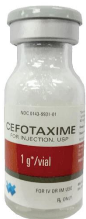
Early Antibiotics improves outcomes in sepsis