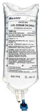
Fluids for Shock