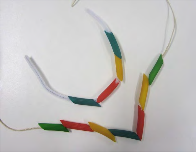
Necklaces can be made with string, or pipe cleaners for young hands