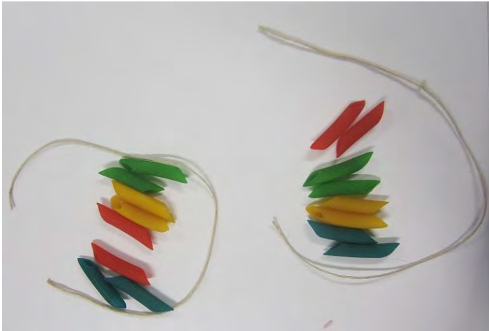
Two matching sets