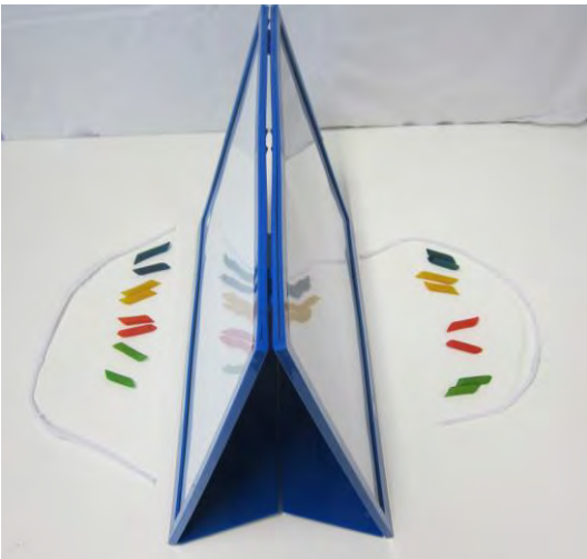
Using a barrier