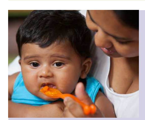
Start with pureed, mashed or mushy foods . As your baby grows, give them small pieces and finger foods to hold.

Remember, if your baby is pushing food out with their tongue then they are not ready for their first foods just yet.