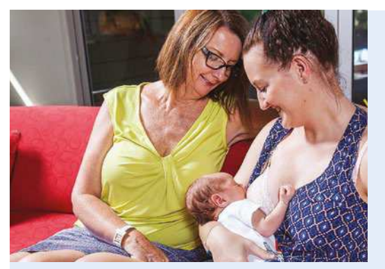
Before 6 months old, breast milk or baby formula is all your baby needs.