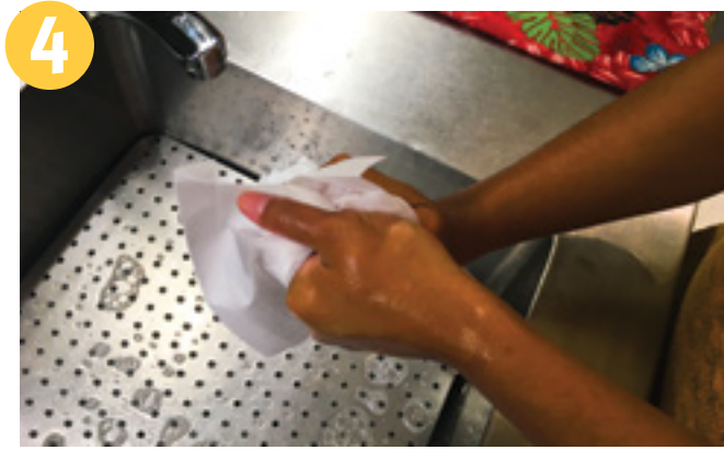
Step 4: Dry hands thoroughly with a paper towel.

Making and eating meals with the family can be easy, fun and healthy! It's important for the whole family to know how to make meals safely to protect the family from getting sick.